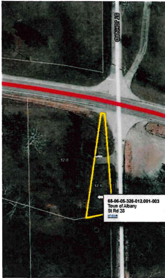
LIFT STATION --E.STATE & ST.JOHN ROAD