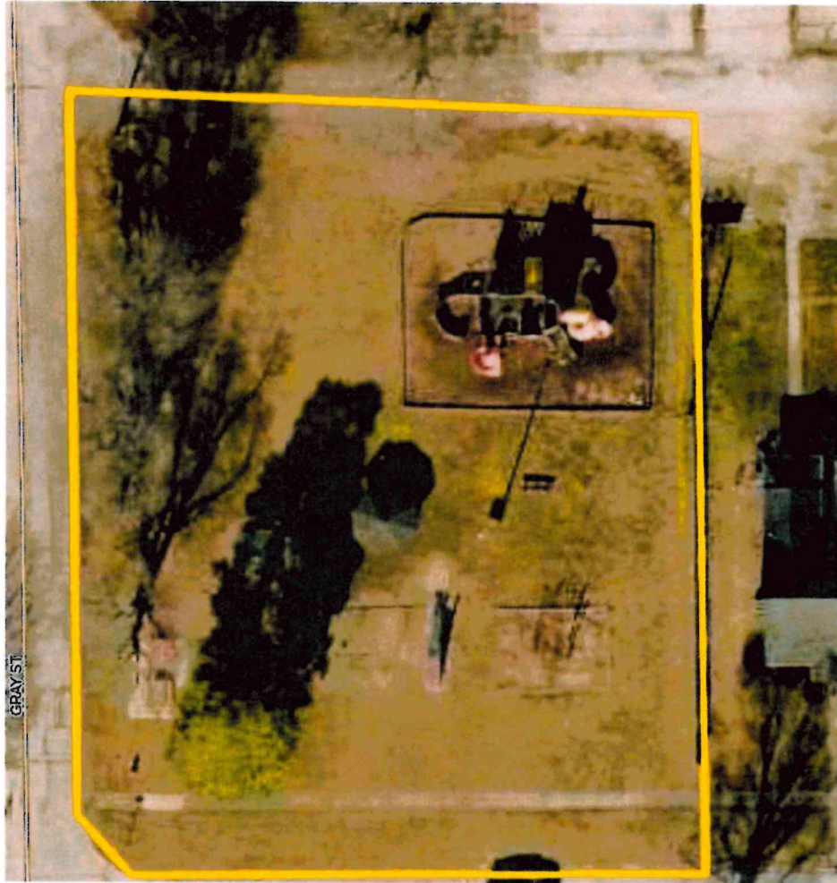
1st STREET PARK--1st & GRAY