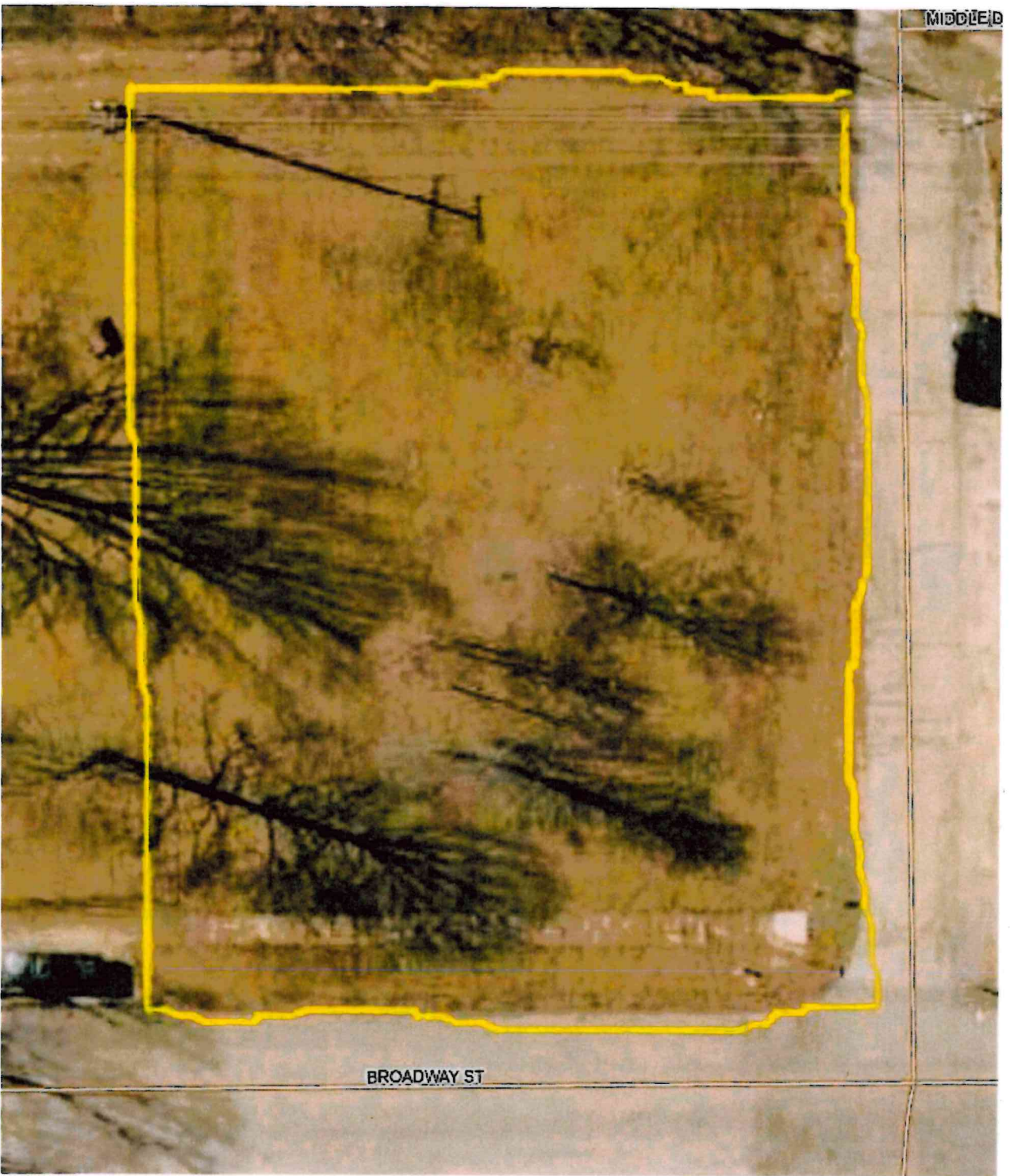
BROADWAY PARK-- BROADWAY & JACKSON